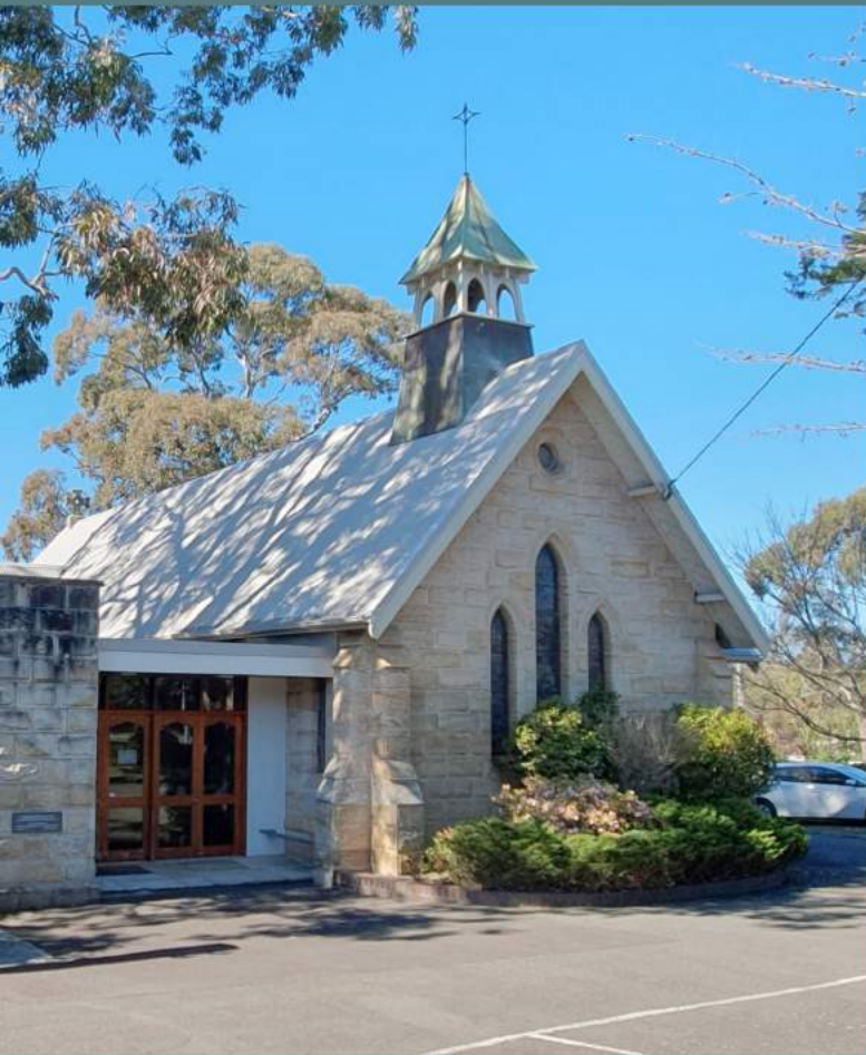
Pearces Corner 1711 Pacific Hwy, Wahroonga