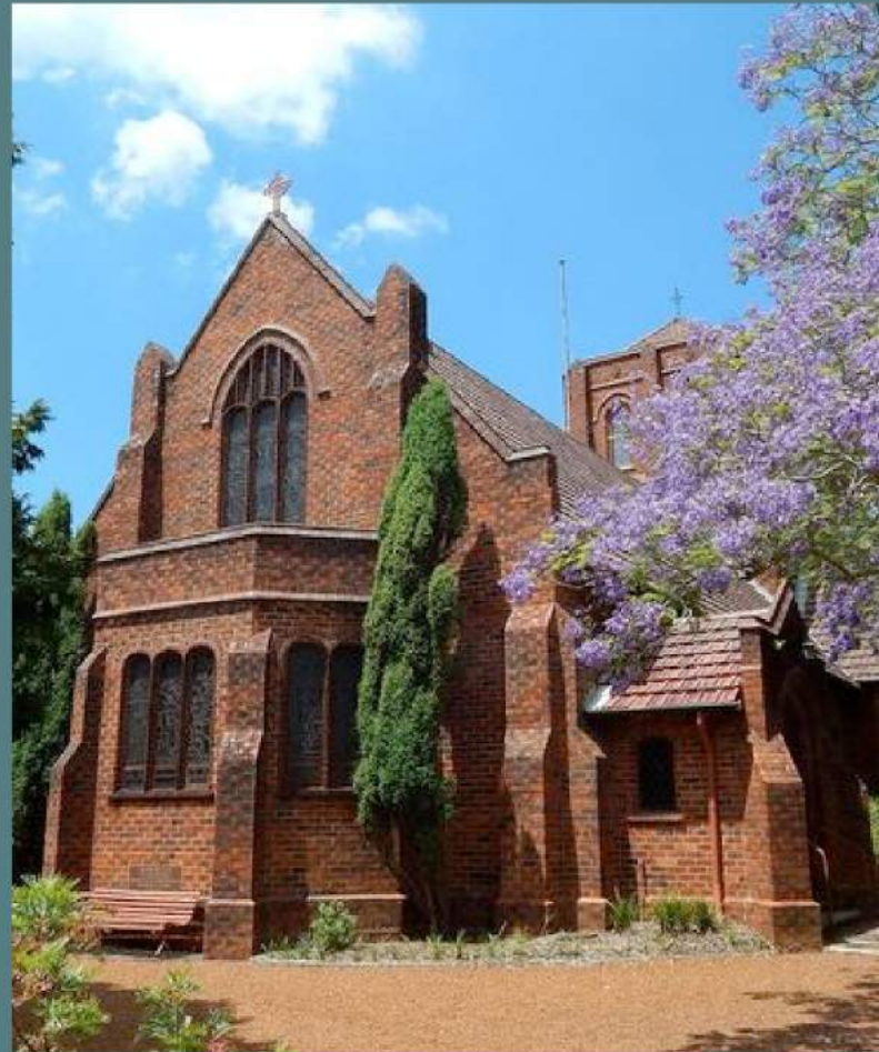
Water Street 2 Water St, Wahroonga